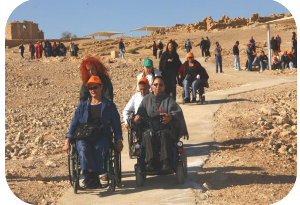
"If we can reach the top of Masada, then nothing can stop us" – SC member