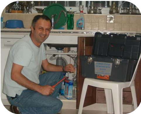
Community Parent repairs a member's kitchen sink (Tel Aviv)