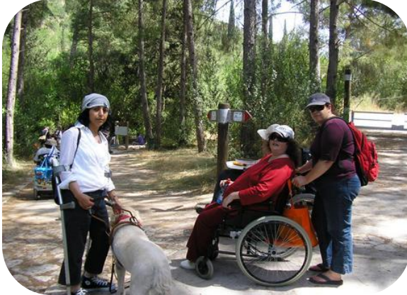
Trip to the Galilee planned by members of the Jerusalem Supportive Community